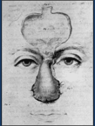
Fig. 1 Indian method of rhinoplasty 1

Flap surgery dates back to 600 B.C., when Indian surgeon Sushruta Samita described nasal reconstruction using a forehead or cheek flap. (Fig.1) Flap surgery only reached Europe in 1779 when Francois Chopart employed a flap from the chin of a patient to close a defect in his lower lip.